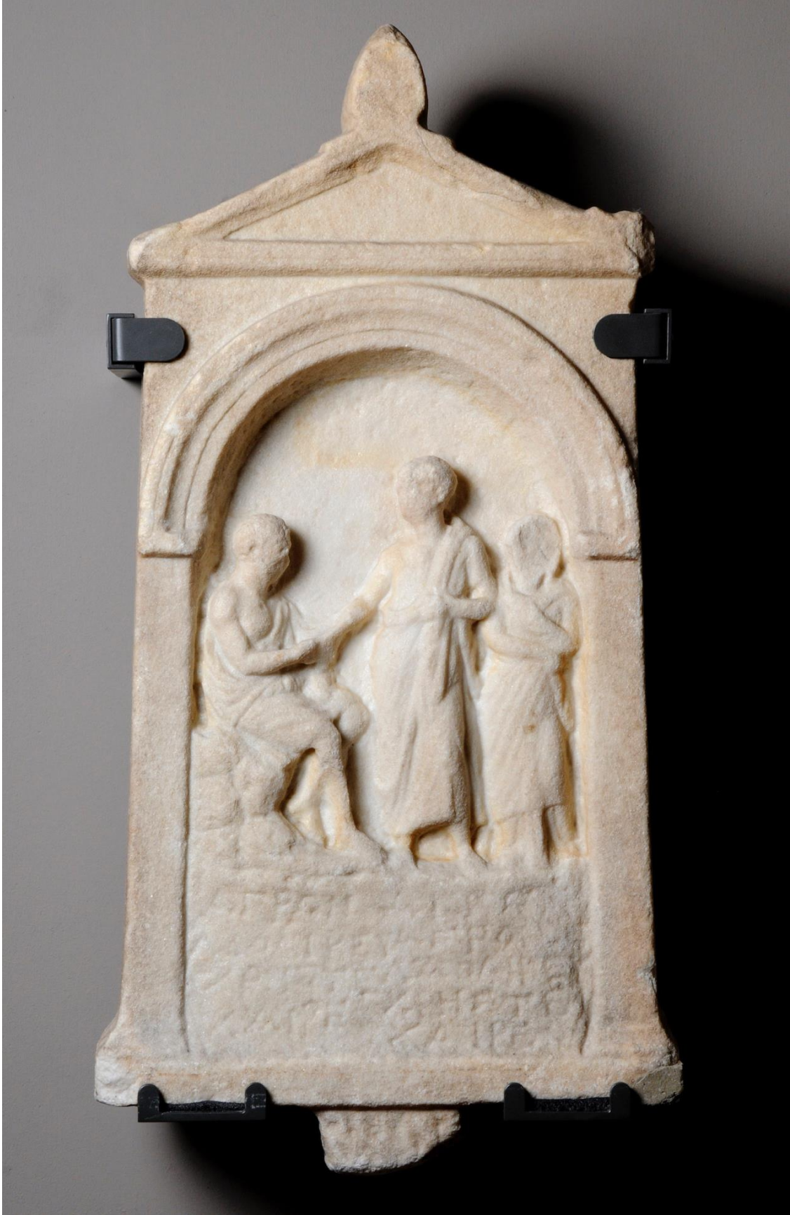
Fig. 4. Appendix.