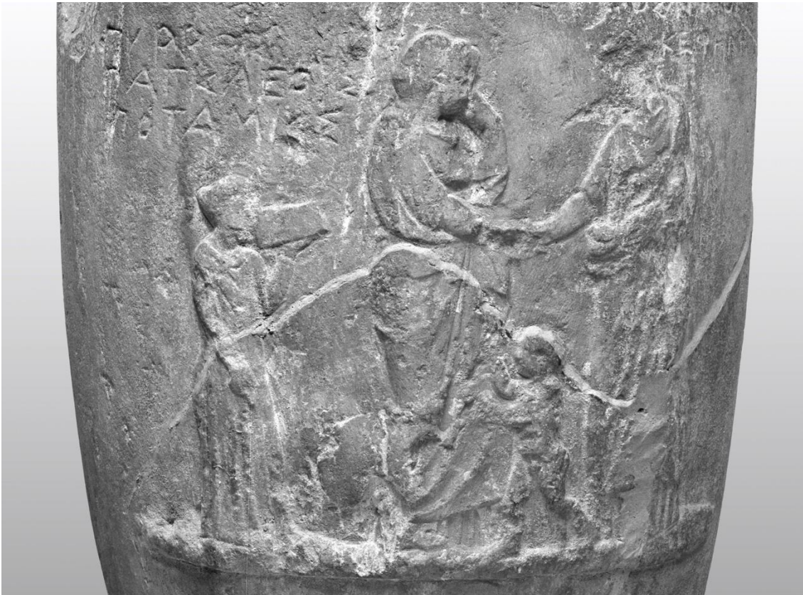
Fig. 6. 1 , relief. Chatsworth. Photograph no. FA 1276-10.