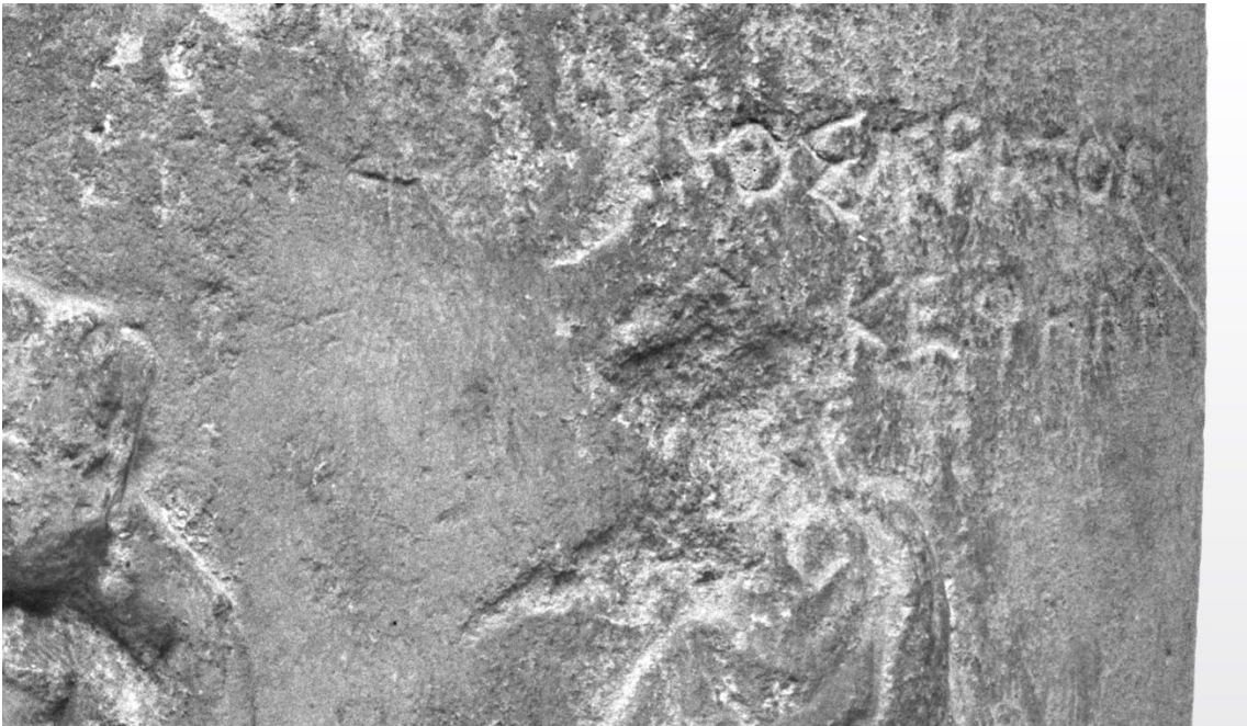
Fig. 5. 1 , detail of Inscription B. Chatsworth. © Forschungsarchiv für Antike Plastik. Köln. Photograph no. FA 1276-10. Photograph: R. Laev.