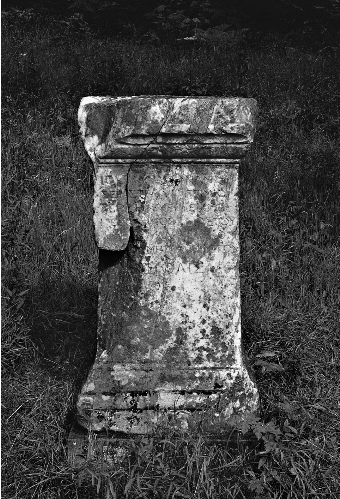
Fig. 7. 2. Chatsworth. © Forschungsarchiv für Antike Plastik. Köln. Scan no. 4224. Photograph: R. Laev.