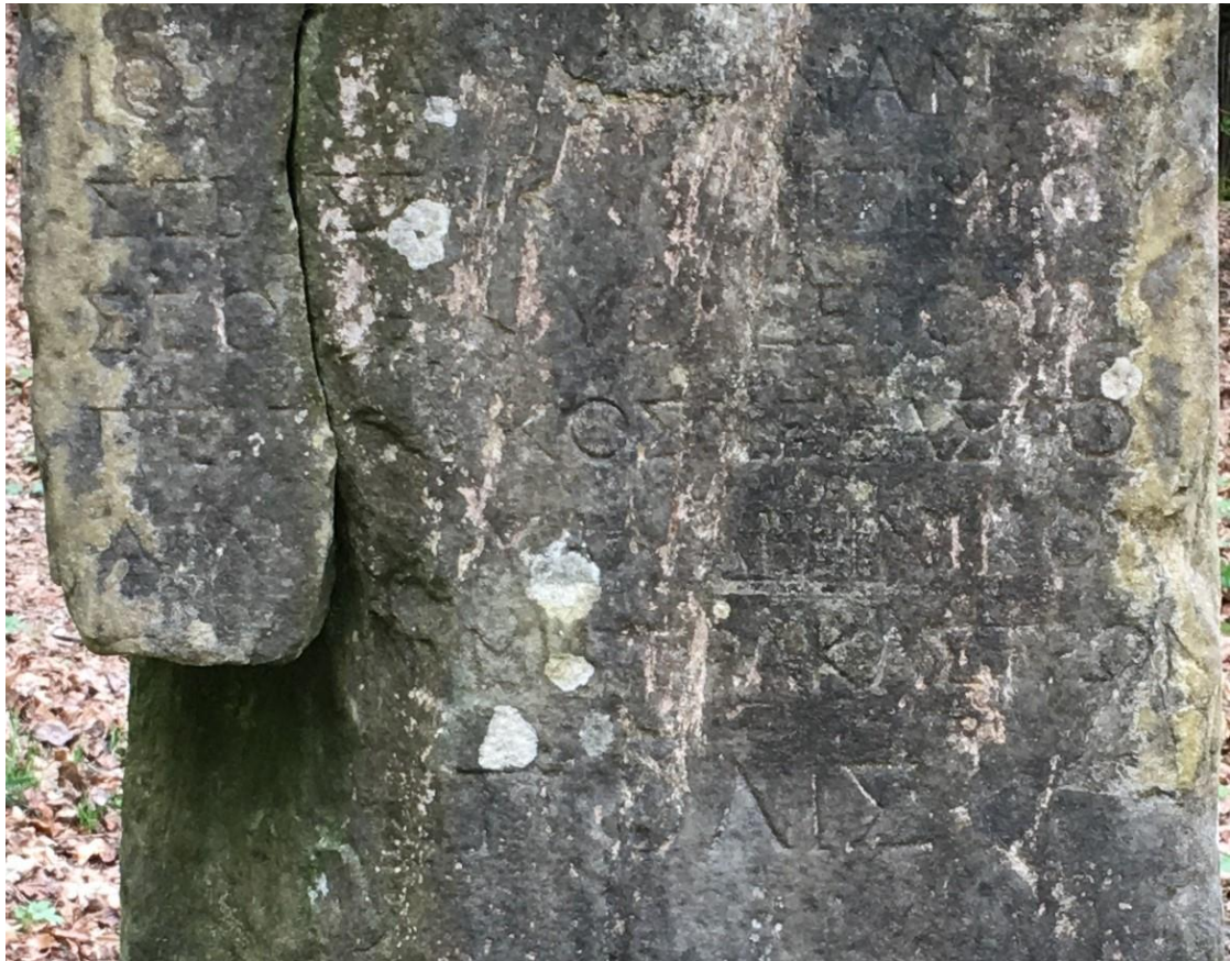
Fig. 8. 2, inscribed text. Chatsworth.