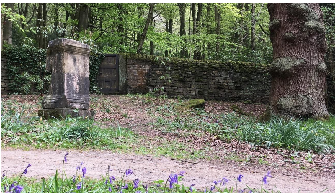
Fig. 2. 2, current setting, Chatsworth Garden.

from some other source. 22 The funerary lekythos (1) does not seem to be included in the Sixth Duke's Handbook to Chatsworth , which might suggest that it had not been acquired by the time that work was produced (in 1845) – or at least by the time that Westmacott produced his hand-list of Chatsworth's antiquities (in 1838). But the Handbook is not comprehensive, nor does it always give detailed descriptions of the objects it does mention; 23 an earlier date of acquisition cannot, therefore, be ruled out. Boschung et al. (p. 16) suggest that the lekythos might have been collected in Athens by the Sixth Duke, but there is no definitive evidence to support this view. Indeed, the fact that the Handbook gives no description of the object might suggest that it was not one of the Sixth Duke's own acquisitions, since he tends to dwell on these in more detail.