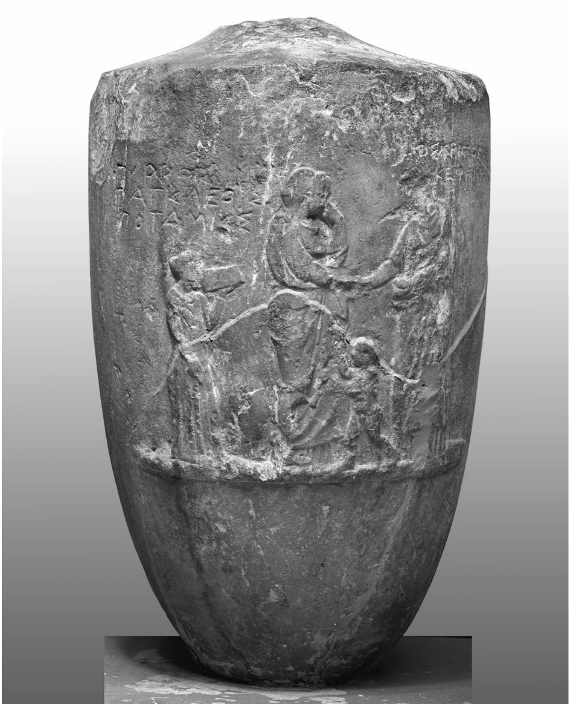
Fig. 3. 1. Chatsworth. © Forschungsarchiv für Antike Plastik. Köln. Photograph no. FA 1276-10. Photograph: R. Laev.