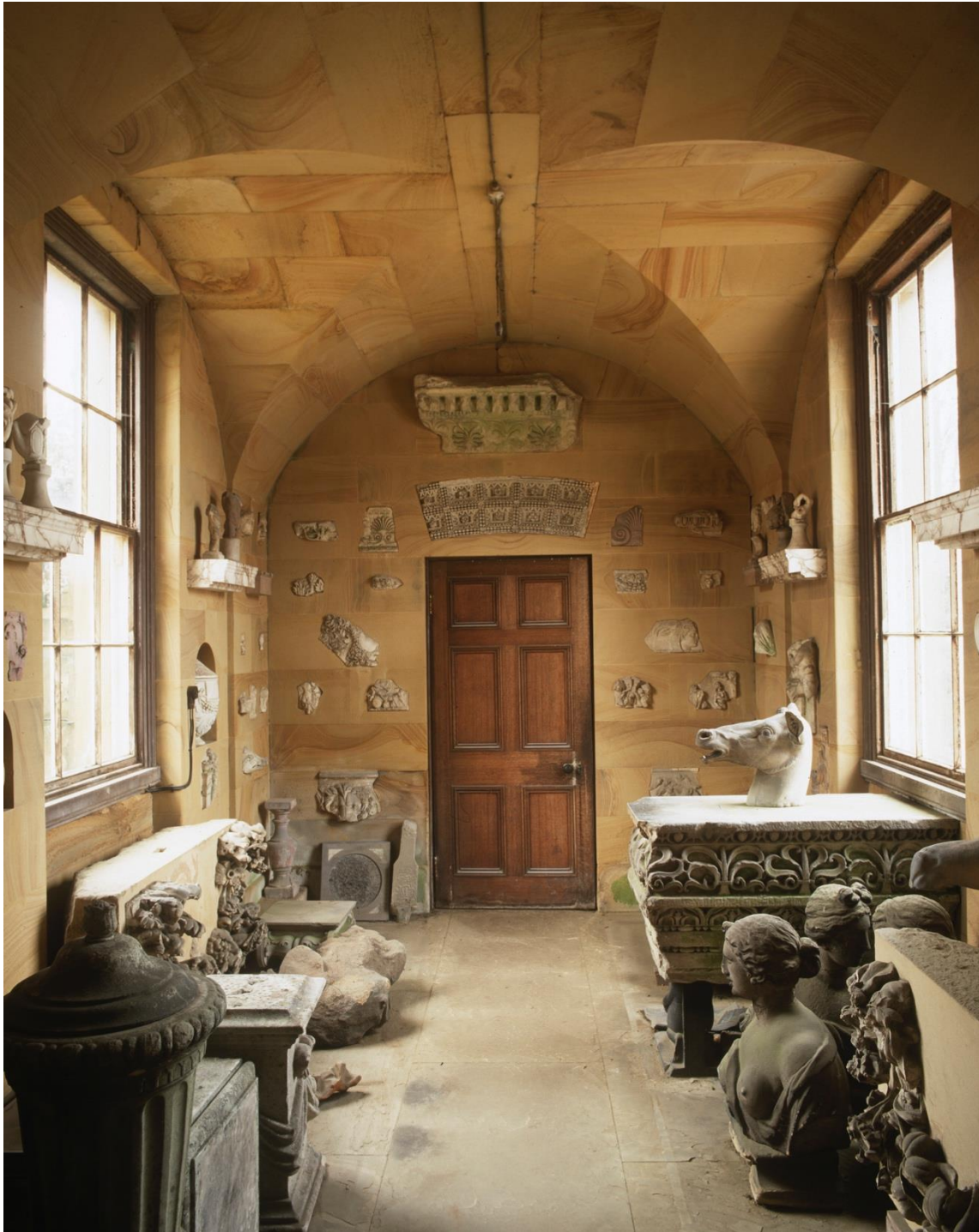
Fig. 1. The "Lodge of Fragments" (or West Lodge), Chatsworth.

Michaelis, the great chronicler of antiquities in Great Britain, included Chatsworth in his study of Ancient Marbles in Great Britain , but did not visit the house himself,