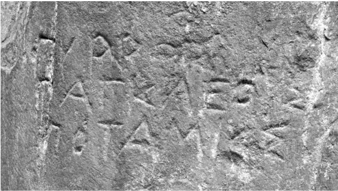
Fig. 4. 1 , detail of Inscription A. Chatsworth. Photograph no. FA 1276-10.